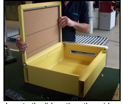
Locate the lid on the other side on the top box and slide the hinge damper into the hole at the front of the unit