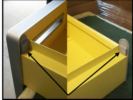
There is a rubber bung at the front and back of the side opening. Remove these by pulling away from the unit