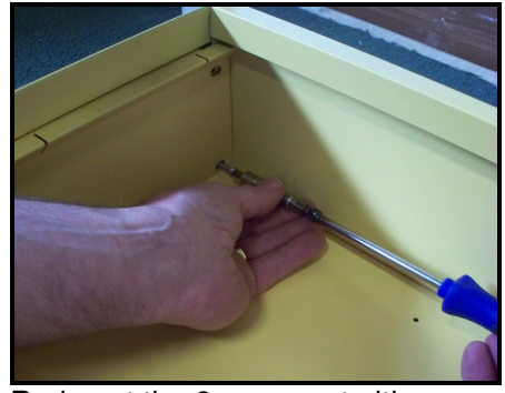
Re-insert the 2 screws at either side of the back of unit to secure the bumpers in place.