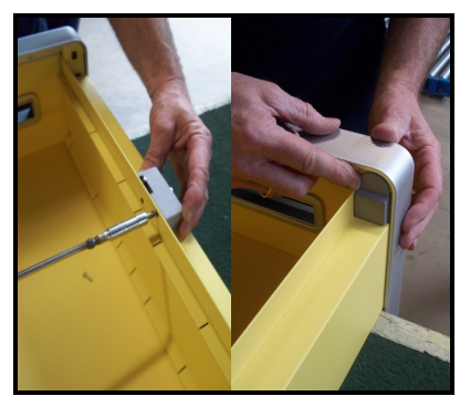
Refit the lock to the open side of the unit and refit the rubber bungs into front and back.