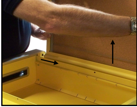
Remove the lid by sliding it towards the back releasing the front hinge and then lift up and away from the unit