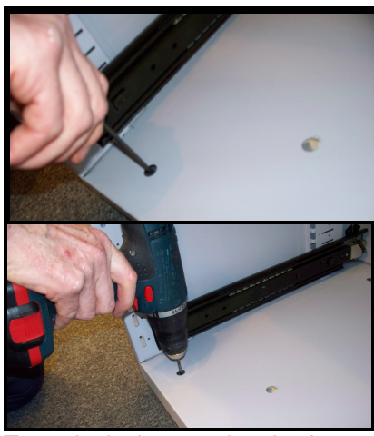
Turn clockwise to raise the foot Turn anti-clockwise to lower