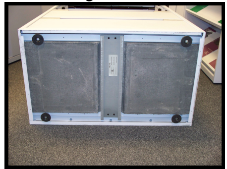
Firstly you will need to empty the unit and lay it down on its back. You may need to place a book or folder underneath the top for ease of returning upright.