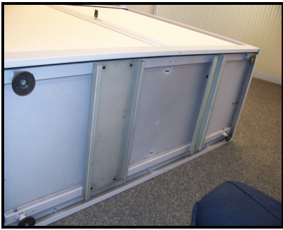
Depending on the width of the unit there may be up to three counterweights and 2 holding plates