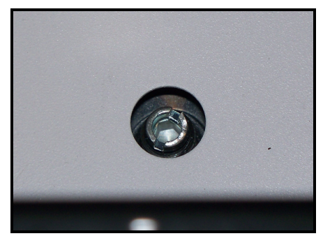
If applicable you will need to remove the bottom one or two drawers to allow access to the bottom of the unit. In each corner there will be access to the feet. They can be adjusted up or down using either an appropriate allen key or flat head screwdriver.