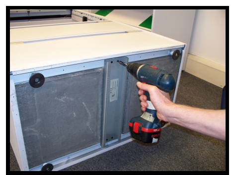
Fix into place by attaching the holding plate with the 4 screws provided.