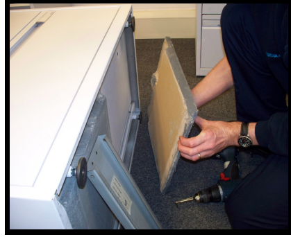
The counterweight can then be removed from the unit.