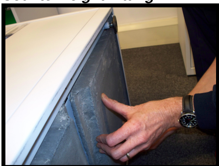
To fit the counterweight insert the edge of the weight underneath the fold on the bottom side of the carcass