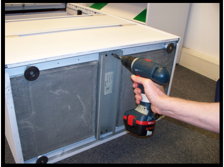
Using an electric or manual screwdriver remove all four screws in each corner of the holding plate and remove the plate. (Please take care as the counterweight may fall out)