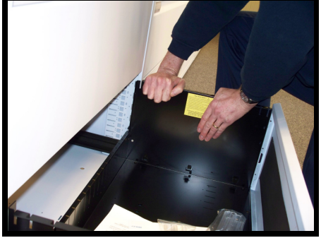
Push down the rear of the drawer on both sides to fully locate the runners tags onto the drawer. You should hear them click into place