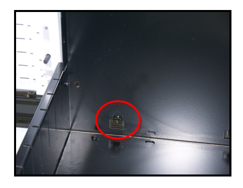
Extend drawer fully, notice that the runners are attached to the side of the drawer by 3 metal lugs

Please take care when removing and refitting drawers as this can be awkward until practised – we recommend 2 people to support each side of the drawer as they can be heavy