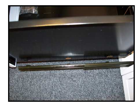
Supporting the weight of the drawer, locate the lugs on the runners into the cutouts in the drawer on both sides