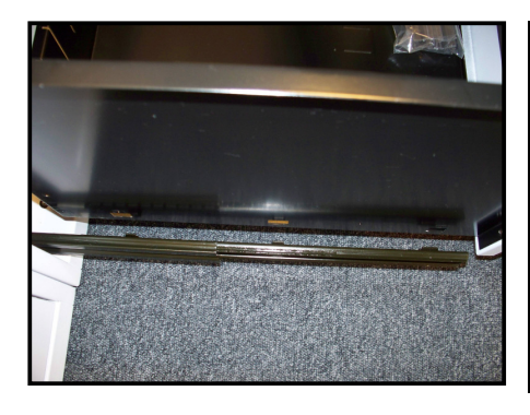
Whilst supporting the weight of the drawer repeat the procedure on the other side of the drawer