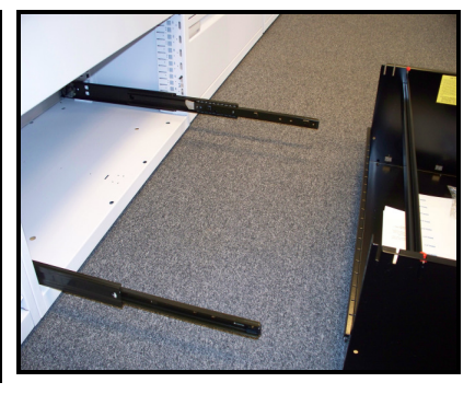
<u>Drawer fitting</u>: Fully extend the runners and line up the drawer.