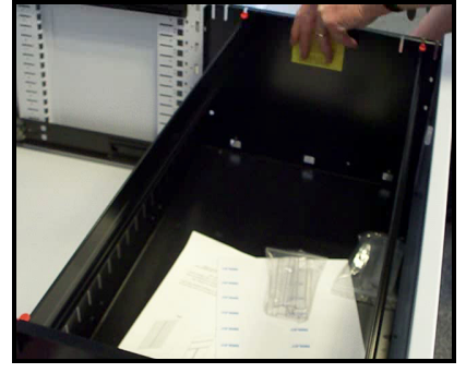
Lift the drawer off the remaining two lugs taking care to support the weight of the drawer.