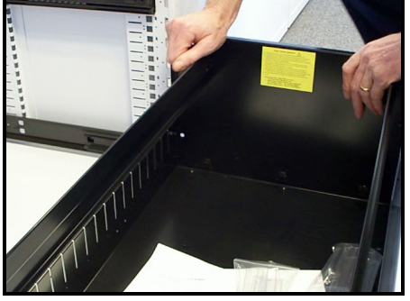
Holding the slide in place lift the back of the drawer upwards and off the rear lug