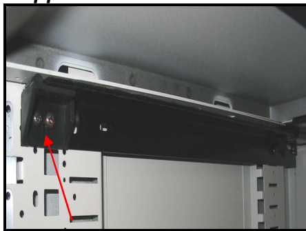
Open the flipper fully. You will see the flipper rail on either side of the unit. There is a black plastic stopper on the front end held in by two screws.