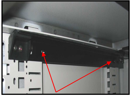
If you wish to remove the flipper mechanism completely, remove the two screws on each flipper rail and remove the rail from unit. Take care to support the rail whilst removing screws.