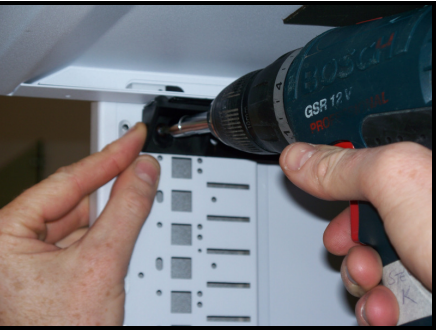
To remove the flipper, remove the two screws holding in the stopper on both sides.