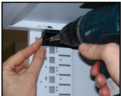
Fix the stopper into place by inserting the two screws.