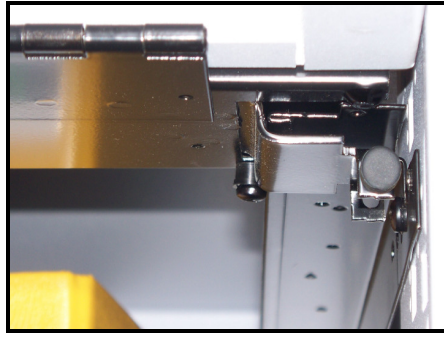
Ensure the slots at the rear of the flipper are correctly located over the rail.