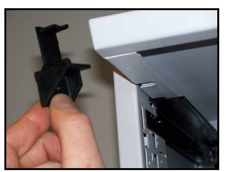
Slide the flipper stop into place over the flipper.