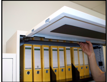
To refit the flipper slide the flipper back into the unit