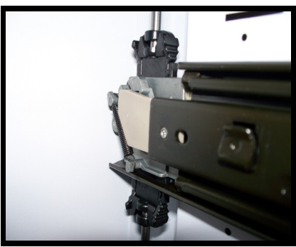
This is what the rear of each middle runner should look like.