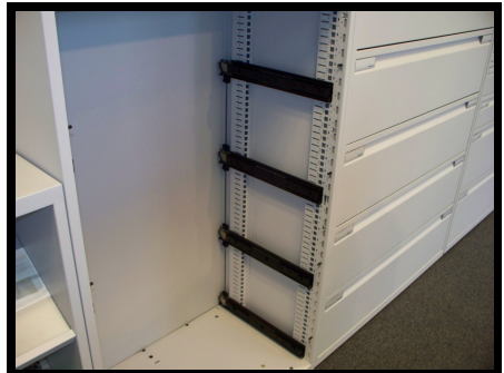
Continue until all runners on both sides are installed.