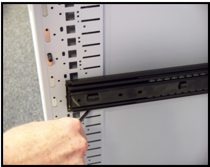
To remove the runners insert a screwdriver into the cut out below each runner and lever upwards. You can then pull the runner towards you away from the unit. (Take care when removing anti-tilt rods)