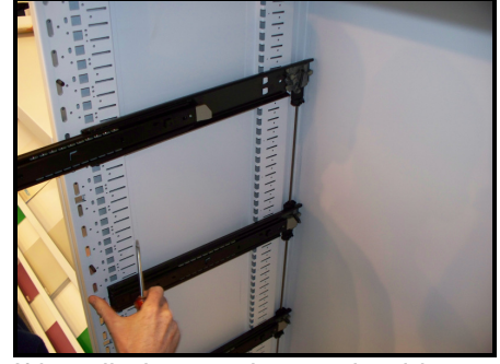
If installed correctly you should only be able to extend one runner at a time on each side of the unit.