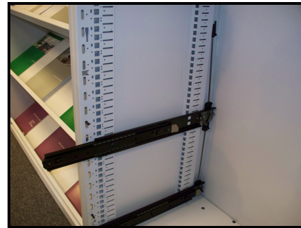
Repeat the previous steps to fit the next runner. (Before locating each runner ensure the runner below is extended)